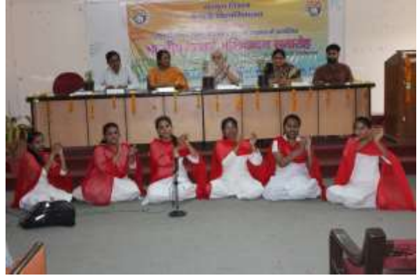
Celebration of the Traditional New Year Vikrama Samvatsara - 2076