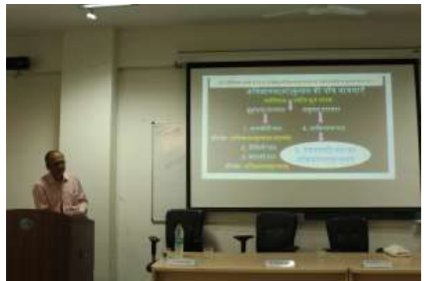
Special Lecture on Sanskrit Diwas, 2019