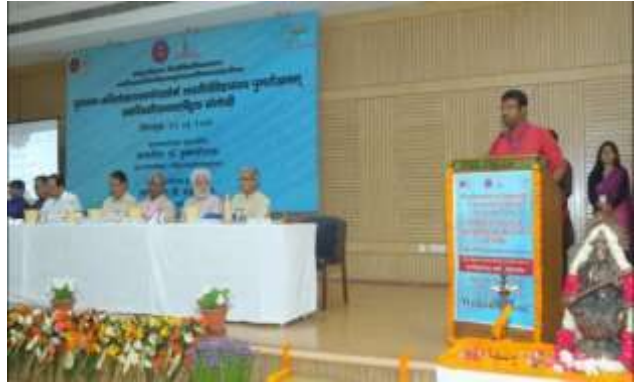
National Seminar on Rewriting of Indian History in the Light of Archaeology and Epigraphy, 2022