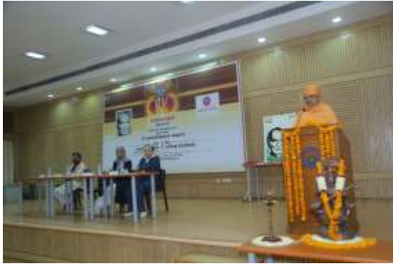
Dr. Indra Chandra Shastri Memorial Lecture, 2021