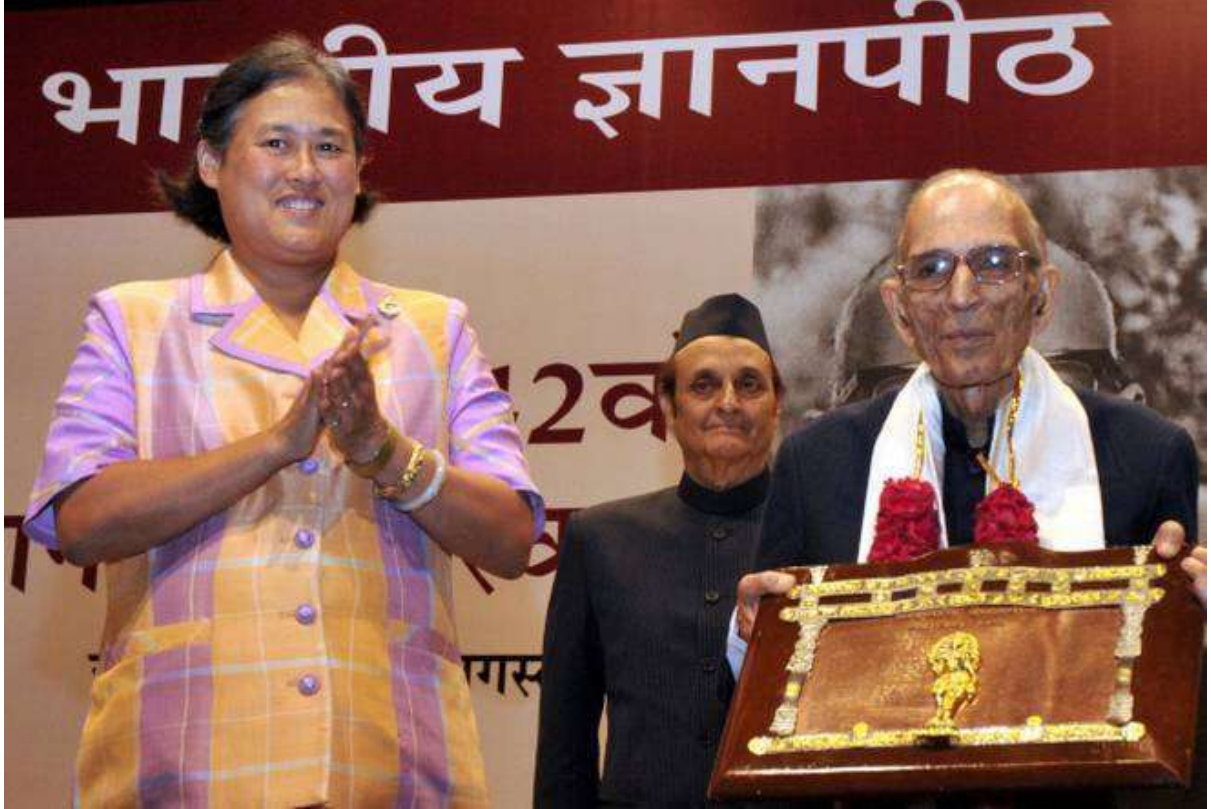
Prof. Satyavrat Shastri

During his career he has won many national and international awards including the Sahitya Akademi Award for Sanskrit. Sahitya Academy conferred on him an award in the year 1968 for his poetry work, Srigurugovindasimhacharitam . He became the first recipient of the Jñanpith Award in Sanskrit language. He also served as Vice-Chancellor of Shri jagannath Sanskrit University, Puri, Odisha.