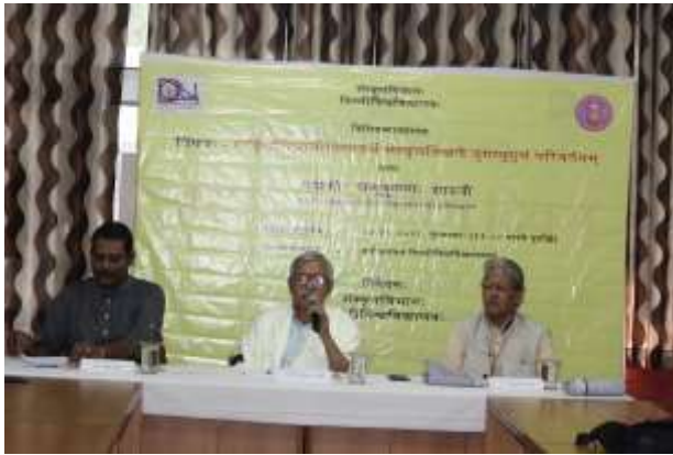
Workshop on IKS & NEP – 2020 (2021)